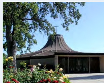
SS Peter & Paul