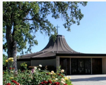
SS Peter & Paul