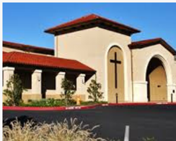
St. Joseph Mareello