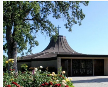
SS Peter & Paul Catholic Church