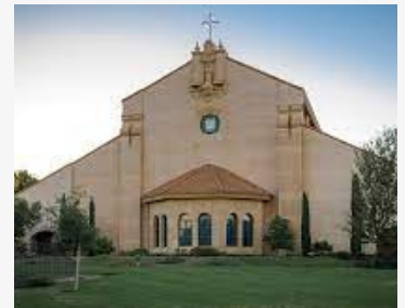
St. Clare Catholic Church