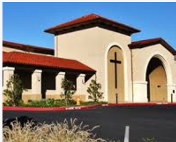
St. Joseph Mareello Catholic Church