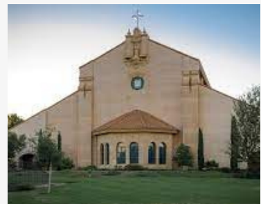
St. Clare Catholic Church