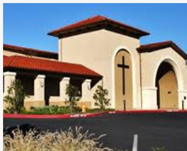
St. Joseph Mareello Catholic Church