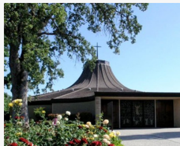
SS Peter & Paul Catholic Church