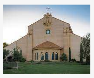
St. Clare Catholic Church