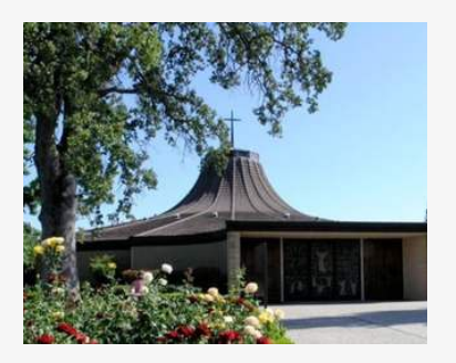
SS Peter & Paul Catholic Church