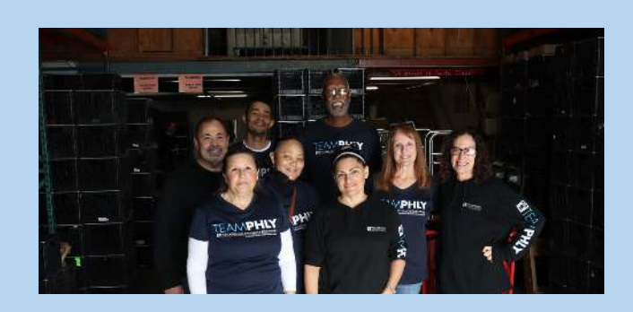
Philadelphia Insurance Company